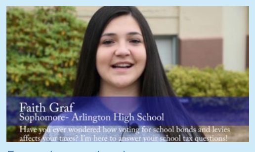
Facts about school taxes