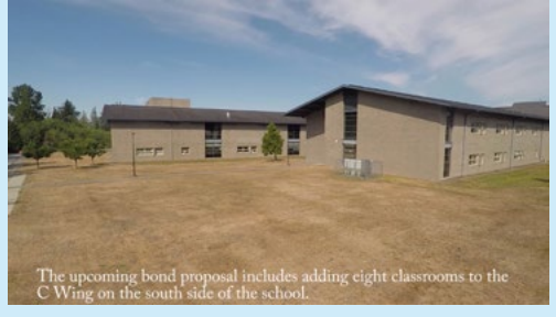
Arlington High School Expansion