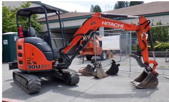
(right) Construction equipment staged at Kent Prairie Elementary for the installation of a secured entryway at the school.