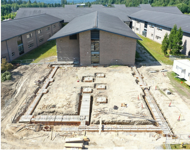
Overhead view of footing construction for Arlington High School classroom addition