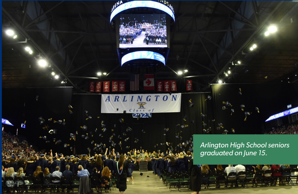
Arlington High School seniors graduated on June 15.