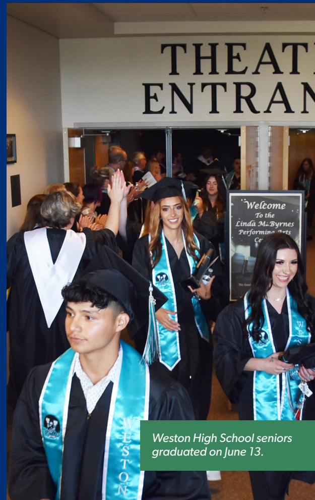
Weston High School seniors graduated on June 13.