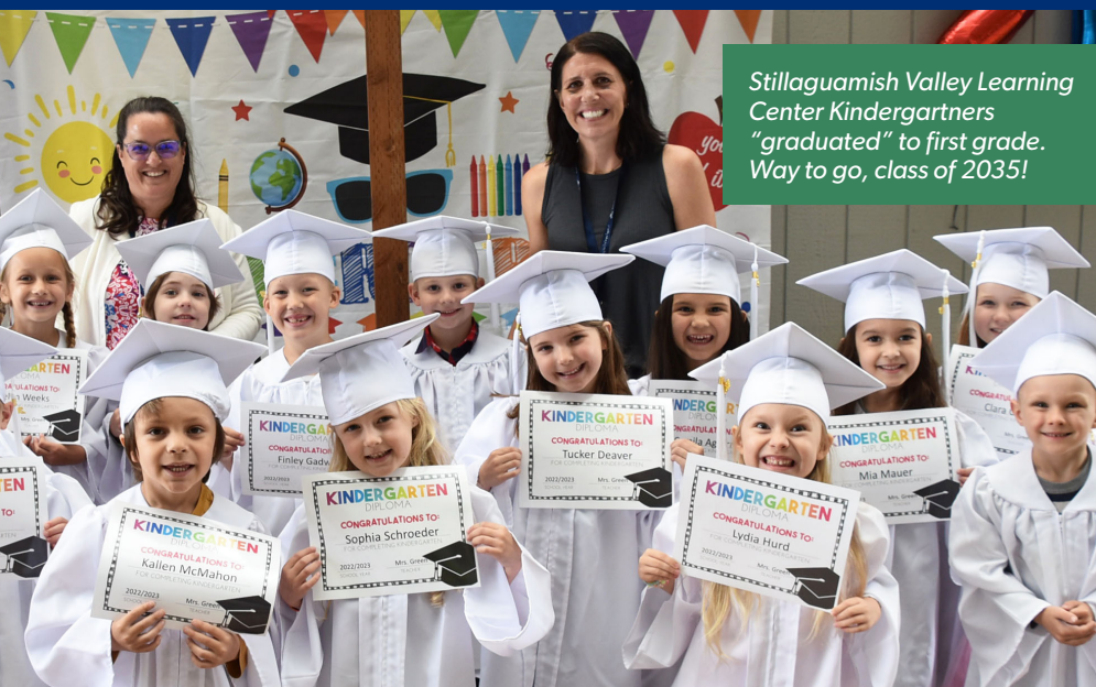
Stillaguamish Valley Learning Center Kindergartners "graduated" to first grade. Way to go, class of 2035!