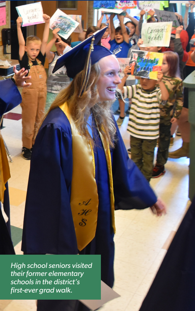
High school seniors visited their former elementary schools in the district's first-ever grad walk.